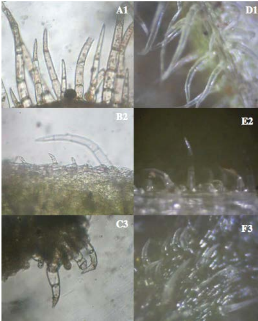
Figure 2. Trichomes of leaf cross sections viewed under the photomicroscope at 100X (A-C) and on the leaf surface viewed with Microncam at 120X (D-F) of C. blumei varieties: 'Defiance' (1), 'Shocking Pink' (2), and 'Small Leaf' (3).