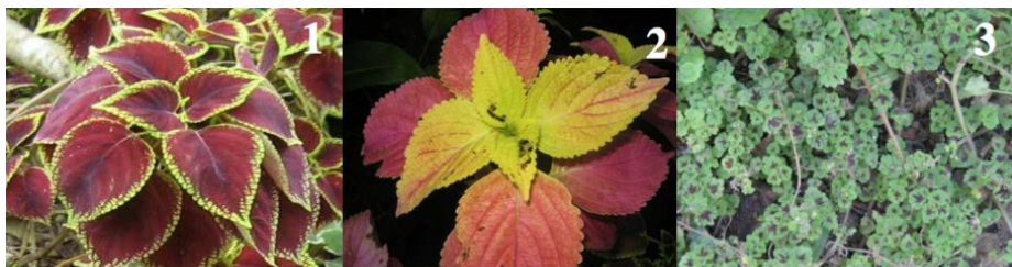
Figure 1. Varieties of C. blumei used: 1. ‘Defiance’, 2. ‘Shocking Pink’, and 3. ‘Small Leaf’.

Examinations of the abaxial leaf surface of the varieties: ‘Defiance’, ‘Shocking Pink’, and ‘Small Leaf’ showed differences in trichome density and length (Fig. 2). The trichomes observed were multicellular and mostly non-glandular. ‘Small Leaf’ variety showed abundant trichomes compared to ‘Defiance’ and ‘Shocking Pink’ (Table 1). Trichomes were mainly found at the midrib and vein area, rather than on the leaf blade. The three varieties differed in trichome length with ‘Defiance’ showing the longest, with average length of 0.254 mm, followed by ‘Shocking Pink’ at 0.101 mm, and ‘Small Leaf’ at 0.097 mm. Analysis of variance (ANOVA) at 5% degrees of freedom showed that varietal differences in trichome length and density were significant.