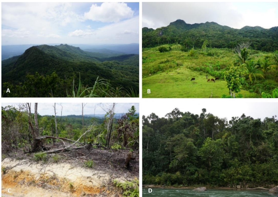
Figure 2. Some of the surveyed sites in Samar Island: (a) Mt. Huraw; (b) San Jose de Buan (c) Hinabanggan and (d) Paranas.

records of orchidaceous species for Samar Island. The compiled data were supplemented with additional field collections in three forest types across the six municipalities of Samar Island. Figure 2 shows some of the surveyed sites within the natural park.