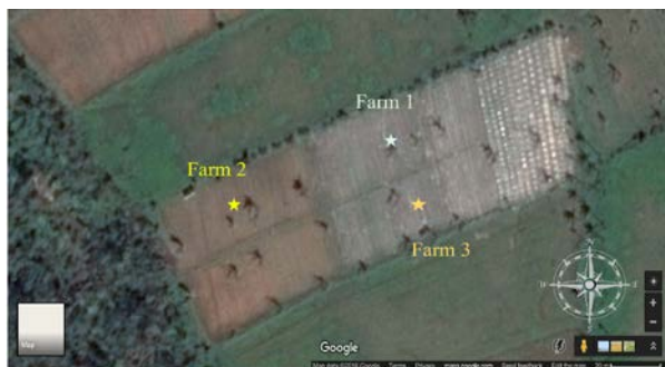
Figure 1. The map of the vegetable farms located in Cabintan, Ormoc City, Leyte ( https://www.google.com.ph/maps/@11.0740147,124.7250463,145m/data=!3m1!1e3?hl=en . Date Accessed: March 23, 2016)

The planting of vegetable crops such as cabbages, beans, squash, eggplants and tomatoes generally constituted Cabintan's land use. The soil samples were collected immediately after the harvest day from the surface soil (0 to 20 cm), subsurface soil (21 to 40 cm), and subsoil (41 to 60 cm) depth within the immediate area of the selected three vegetable farms under the OK-RANGE of Cabintan, Ormoc City, Leyte. Figure 1 shows the three selected vegetable farms at Cabintan, Ormoc City, Leyte. There were three sampling points randomly assigned per vegetable farm. Farm 1 had a map coordinates of 11°04'26.9"N 124°43'30.8"E, while Farm 2 and Farm 3 had coordinates of 11°04'26.1"N 124°43'28.8"E and 11°04'26.0"N 124°43'31.1"E, respectively.